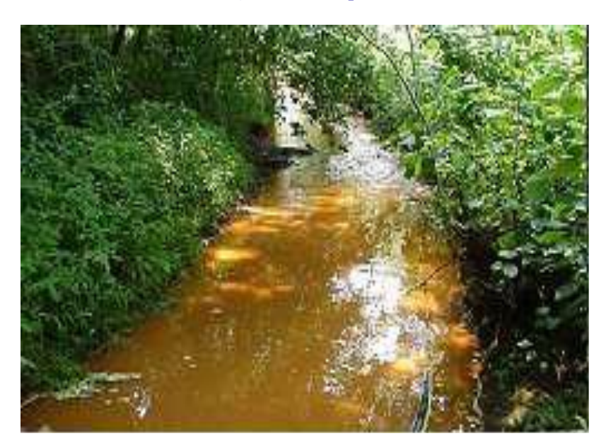
Fig.2 Waste disposal

Table.7 Physicochemical characteristics of water samples of rivers at the upstream (U) and downstream (L) from the coffee processing plant discharge points (units in mg/l or otherwise stated).